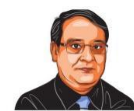
SUSHIM BANERJEE DG, Institute for Steel Development & Growth

Agriculture, forestry and fishing sector in GVA is up 5.9% in Q4 as compared to 3.0% in Q1. As a result, this sector has clocked a growth rate of 4.0% in FY20 as opposed to only 2.6% in FY19. As WPI for