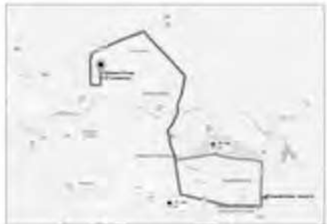
Route Map - Gandhidham Station to Welspun