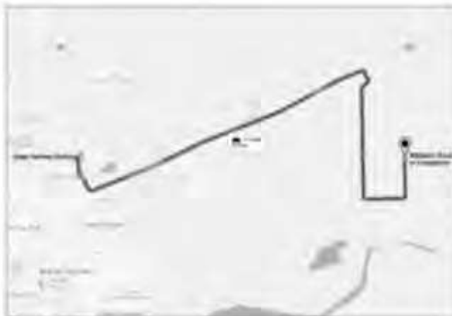
Route Map - Anjar Station to Welspun